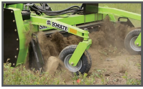
- Great for land use preparation -