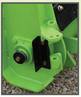
- Heavy duty bearings -Same bearing as used on SRW-1400