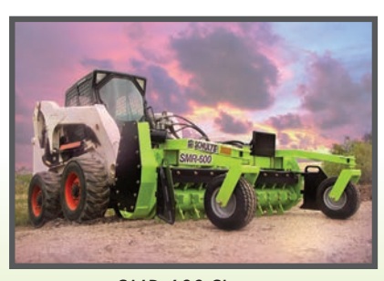
- SMR-600 Shown -